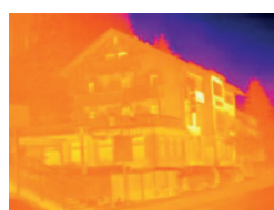
Thermal image without ScaleAssist

Since the temperature scale and colouring of thermal images can be adapted individually, it is possible that the thermal behaviour of a building, for example, can be wrongly interpreted. The testo ScaleAssist function solves this problem by adjusting the colour distribution of the scale to the interior and exterior temperature of the measurement object and the difference between them. This ensures objectively comparable and error-free thermal images.