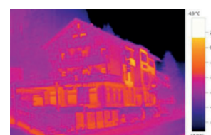
Thermal image with ScaleAssist