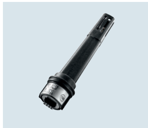
Temperature/humidity module Ø 25 mm, plug-in