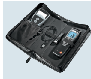
Case for secure storage of measuring instrument (without content)