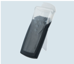
Topsafe testo 315-3