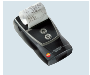
Testo fast printer IRDA with wireless infrared interface