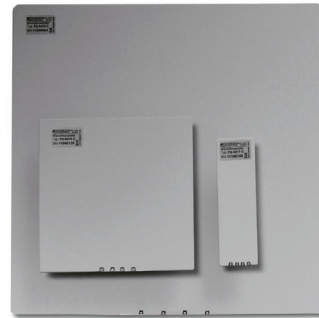
model 117, 118, 119