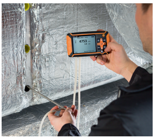
Removable instrument allows Pitot tube measurements in ducts (Pitot tube available separately)