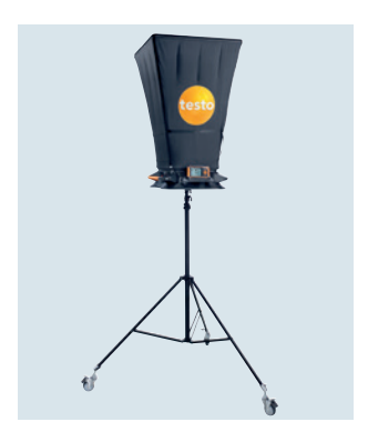
Stable, wheeled tripod with central fitting for secure working at high ceiling outlets.