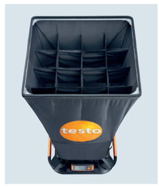
Flow straightener for significantly more precise measurements at swirl outlets.