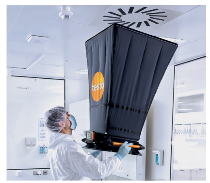
Comfortable measurement thanks to low weight